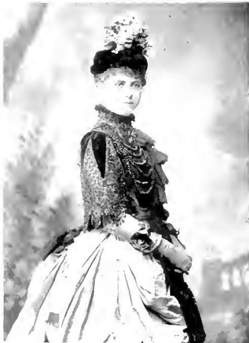
MARIE VAN ZANDT.